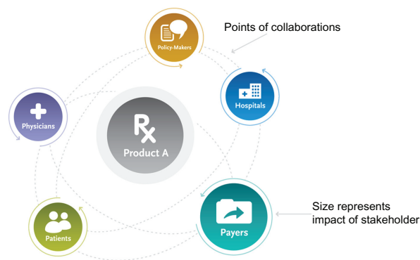
Figure 1 360° view of products by multiple market stakeholders.

intended to study treatments under ‘real world’ conditions of use. 11 The study design can be viewed as a hybrid between a randomized clinical trial (RCT) and an observational cohort study, with randomization to avoid confounding, and end-points evaluated mainly through observational follow-up. An example is the VOLUME Trial to evaluate the long-term pulmonary and cardiovascular safety of an inhaled insulin powder. 12